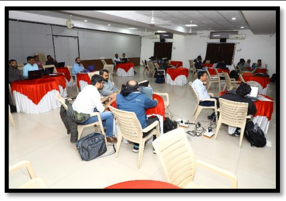
In the Practice session One-page sample translation was done by the translators of the allotted course material.